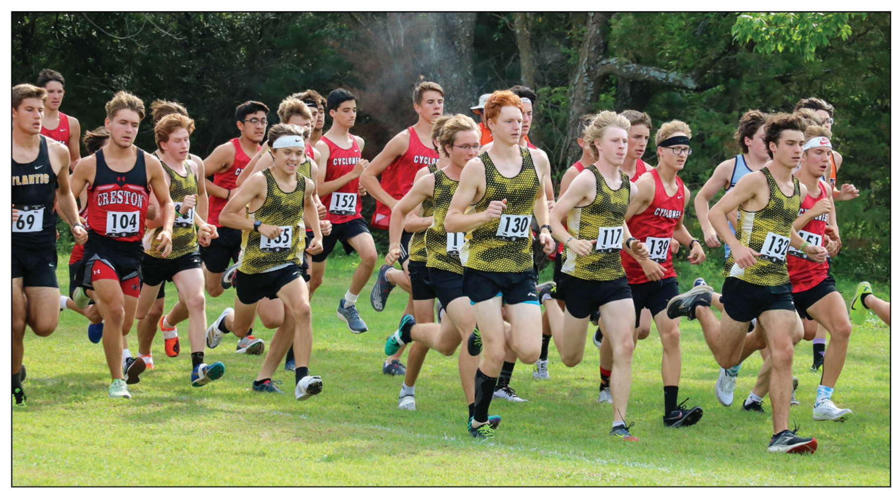
The fourth ranked Glenwood boys cross country team opened its season Saturday with a win at its own Glenwood Cross Country Invitational. The Ram girls also won their team title.

"We had four guys, our second, third, fourth and fifth runners, all finished within 15 seconds of each other," he said. "That's an incredible spread and then you look at our first through our fifth runners and it's only 1:15. That's pretty special. We're