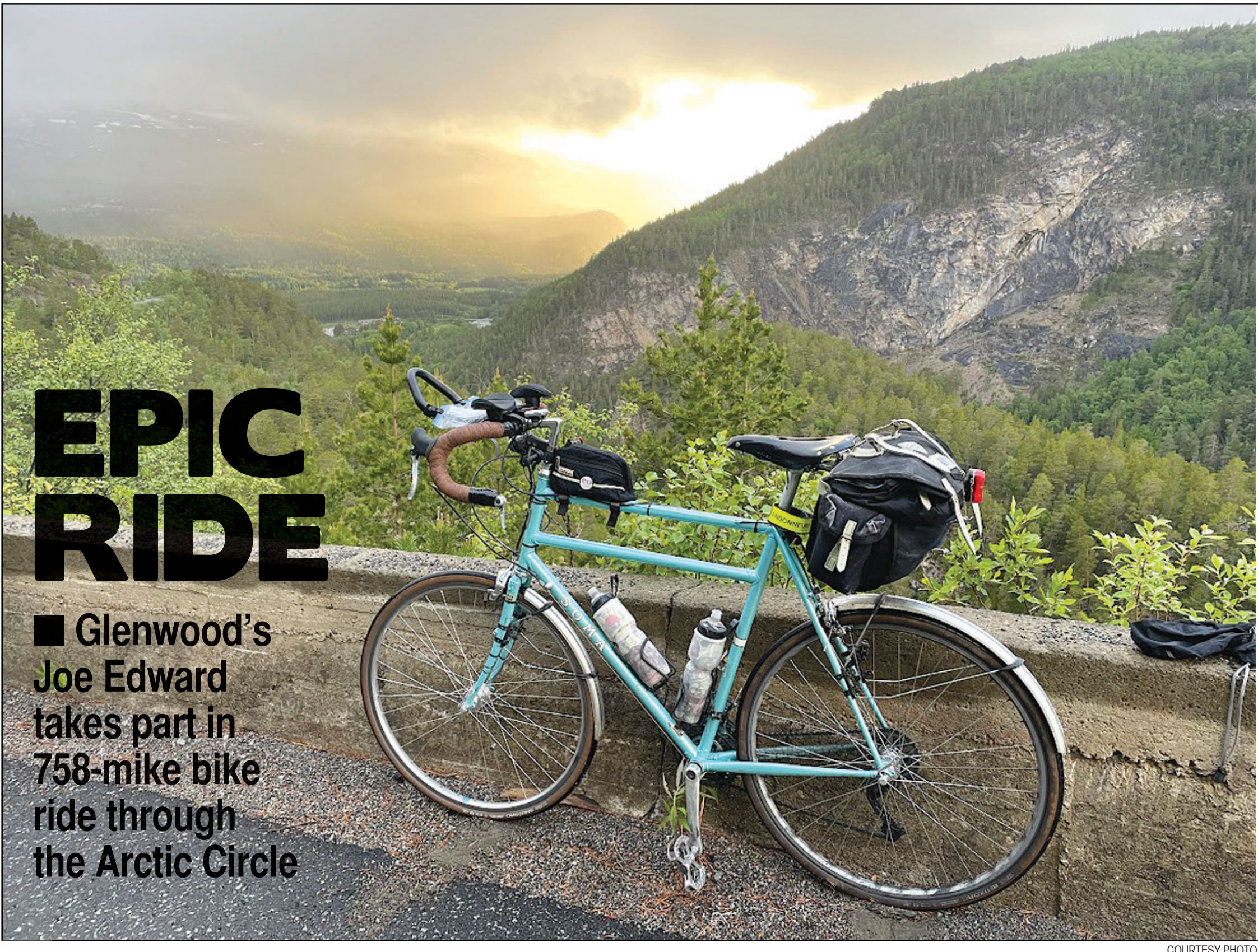
Joe Edwards took part in the Midnight Sun Ran Randonee in June, riding from Umea, Sweden, into Norwary, through the Arctic Circle and back, in just under 90 hours.