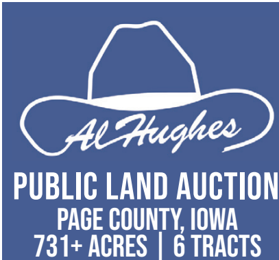
THURSDAY, SEPTEMBER 1ST Elks Lodge, Shenandoah 709 S Fremont Street