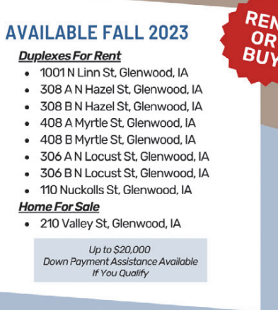
AFFORDABLE FAMILY HOMES MILLS & FREMONT COUNTIES