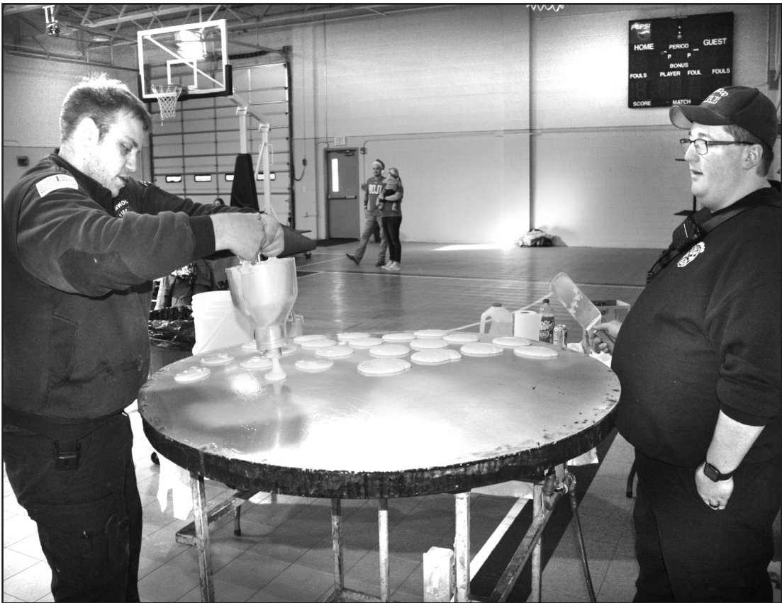
Reach/SADD chapter members from Glenwood Community High School coordinated several children's activities at Breakfast With Santa.