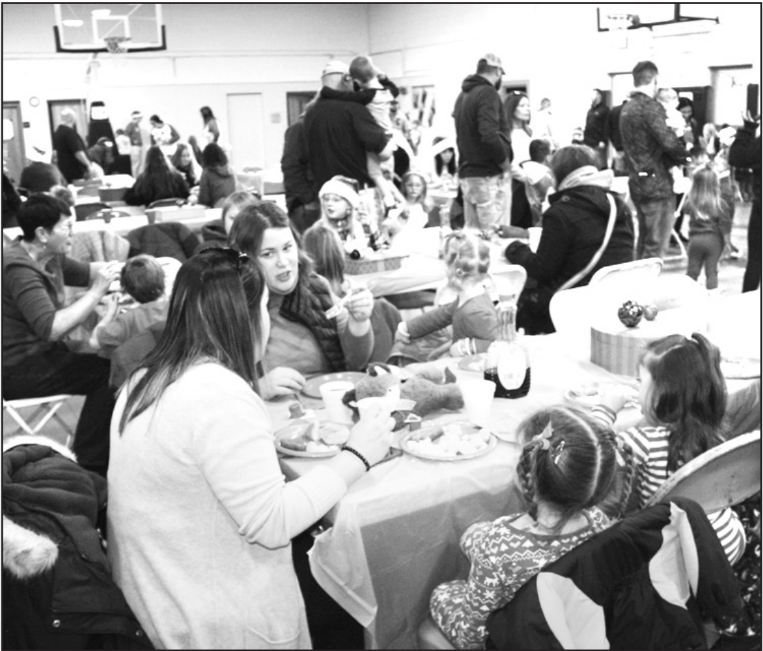
The Reach/SADD chapter at Glenwood Community High School, the Mills County YMCA and Glenwood Fire Department hosted the 21st annual Breakfast With Santa Dec. 3 in Glenwood. The event included breakfast, children's activities and photos with Santa Claus.